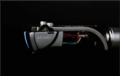
DS 003 Mono