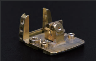
Solid Brass Base for Rich and Powerful Sound

The DS Audio Mono series cartridges are specifically designed for mono records, utilizing a suspension system that detects only lateral (left-right) stylus movements. Unlike stereo records, which encode audio through both lateral and vertical groove modulations, mono records use only lateral movements to convey audio information. By detecting only these lateral signals with high precision, the Mono cartridges eliminate unnecessary components and allow the unique sonic characteristics of mono records-such as clarity, impact, and tonal richness-to be faithfully reproduced. This dedicated design maximizes the expressive power of mono recordings, delivering the full emotional impact captured in each performance.