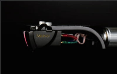
DS W3 Mono