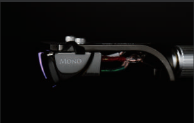
DS Master3 Mono