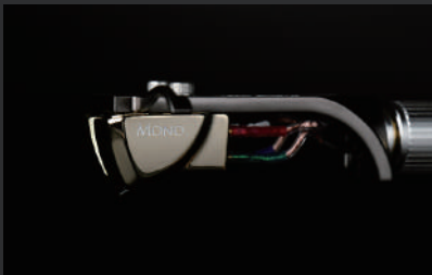
Grand Master Extreme Mono

This allows customers to choose freely between stereo and mono versions according to their listening environment or musical preferences, without any cost differences. The DS Audio Mono series provides an ideal solution for fully unlocking the charm of mono records in their purest form.