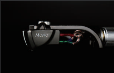
Grand Master Mono